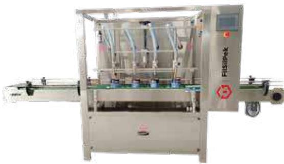
Automatic Multi Head Load Cell Base Filling Machine