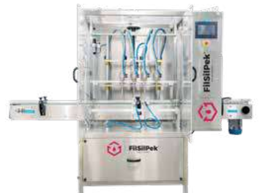
Automatic Budget Friendly Servo Base Filling Machine