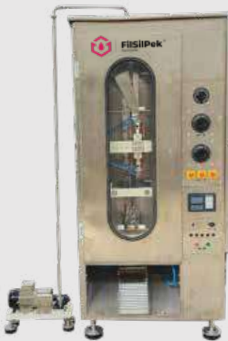
Pouch Packing Machine