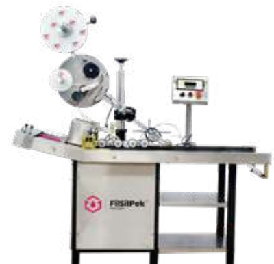
Feeder with label applicator