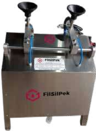
Semi Automatic Air jet Cleaning Machine

"FILSILPEK" provides air jet cleaning machine. This machine uses high-velocity air to remove dust and contaminants, ensuring thorough cleaning of glass, plastic, and HDPE bottles. It offers customizable cycles which is suitable for various industries, and promotes eco-friendly practices.