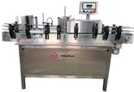
Automatic Round Bottle Sticker Labelling Machine

Label Length: 10 mm to 280 mm Label Height: 10 mm to 150 mm