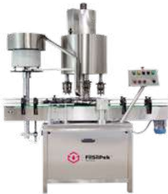
Automatic Multi Head Capping Machine

"FILSILPEK" extends in manufacturing Multi-Head Capping Machines. This machine gives perfect solution for high-speed applications which need to accommodate a large number of caps, but also offer special pick & place capabilities. We offer an exceptionally rugged machine designed for the toughest conditions. Various designs, sizes and materials of caps are possible to seal in our machines.