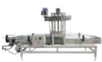
Lid Pressing Conveyor