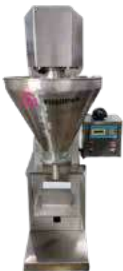
Semi Automatic Powder Filling Machine Filling range: 10gm to 1000gm

"FILSILPEK" expertly manufactures Semi Automatic and Automatic Auger type Powder Filling Machine constructed using stainless steel sheet with highly equipped laser cutting and best quality fabrication. The unit is made compact, versatile and entirely enclosed in stainless steel exquisite matt finish body. The machine is equipped with a sophisticated control panel that includes all the necessary controls, buttons and indicators for your convenience.