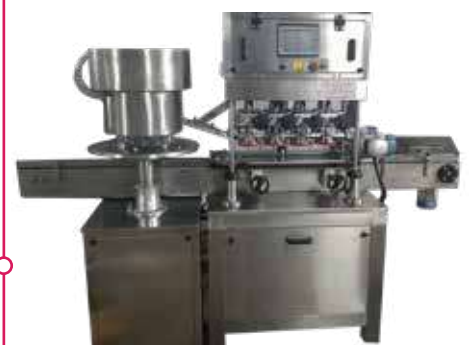
Automatic Spindle Capping Machine

22 mm to 100mm Diameter (Above 65mm cap Size using Elevator for feeding)