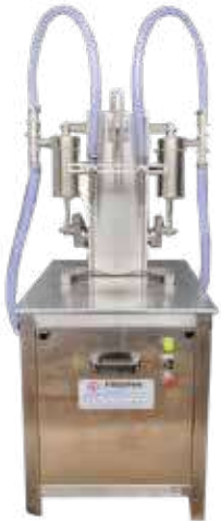
Semi Automatic Liquid Filling Machine