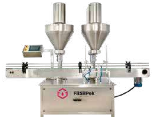
Automatic Multi Head Powder Filling Machine Filling range: 10gm to 1000 gm, 1000gm to 5000gm