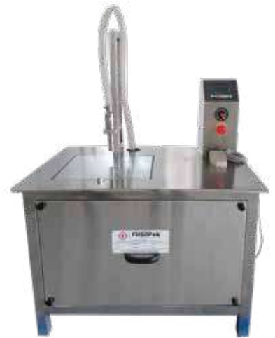
Semi Automatic Load Cell Base Weigh Metric Filling Machine

"FILSILPEK" presents an Automatic Load Cell Based Weigh Metric Liquid Filling Machine designed to weigh various types of liquids accurately, efficiently and quickly without human intervention. The machine consists of a weighing system controller, motor drive and accessories. This machine is made up of stainless steel material so it is durable enough to last long time without any problems. The unit comes with a touch screen display that provides ease in monitoring operation. Here weighing is possible by both with and without containers.