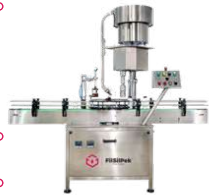
Automatic Capping Machine

22mm to 100mm Dia (Above 65mm cap size using elevator for feeding)