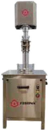
Semi Automatic Capping Machine

"FILSILPEK" is an expertise in manufacturing Semi Automatic and Fully Automatic Inner and Outer Capping Machine. The machine is versatile and self supported on height-adjustable, stainless-steel legs. The entire machine is precision built on a sturdily welded stainless steel frame, completely enclosed in a stainless-steel sheet. We design various kinds of capping heads for Lug Caps, Plastic Screw Caps, Press-fitting Caps, ROPP Caps and Crown Caps.