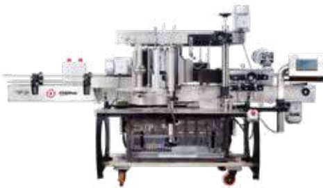
Automatic Front-Back & Round Sticker Labelling Machine

Label Length: 200 mm to 450 mm Label Height : 10 mm to 150 mm