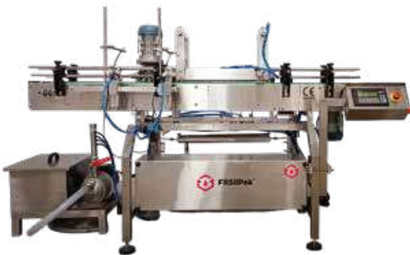
Automatic Water jet Cleaning Machine

"FILSILPEK" provides a water jet cleaning machine. This machine uses a high-pressure pump to build up pressure and drive water through a nozzle. The nozzle directs high-pressure water to remove dirt, filth, and harmful substances from the container. The water jet cleans effectively without the use of chemicals.