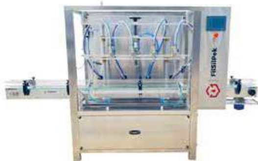
Automatic Servo Base Filling Machine

Filling Range: 50 ml to 5000ml, 5 liter to 25 liter