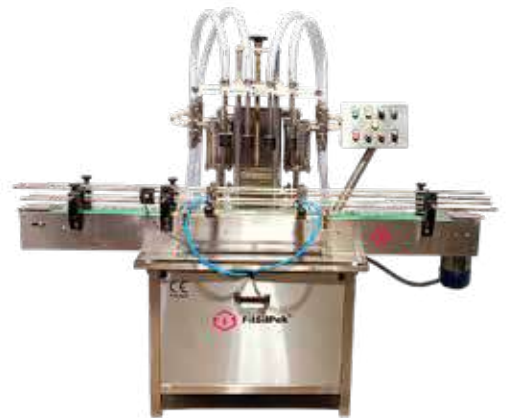
Automatic Liquid Filling Machine