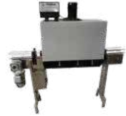
Online Shrink Tunnel With Conveyor