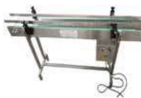
Slat Chain Conveyor