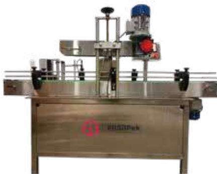
Automatic One side Flat Bottle Sticker Labelling Machine

Label Length: 10 to 100 mm Label Height: 10 mm to 150 mm