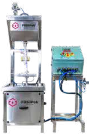
Semi Automatic Gravity Load Cell Base Filling Machine

"FILSILPEK" presents a semi-automatic Weigh Metric Liquid Filling Machine. The semi-automatic gravity base load cell filling machine meets the requirements of filling tin and plastic containers. Minimum adjustment is required to set different capacities with varying containers. and the semi automatic Load Cell Based Weigh Metric Liquid Filling Machine designed to weigh various types of liquids accurately, efficiently