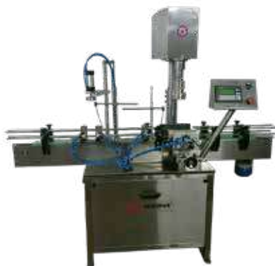
Automatic Linear Capping Machine

22mm to 100mm Dia (Above 65mm cap Size using Elevator for feeding)