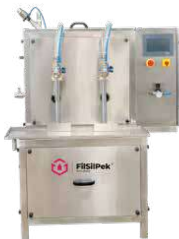
Semi Automatic Servo Base Filling Machine