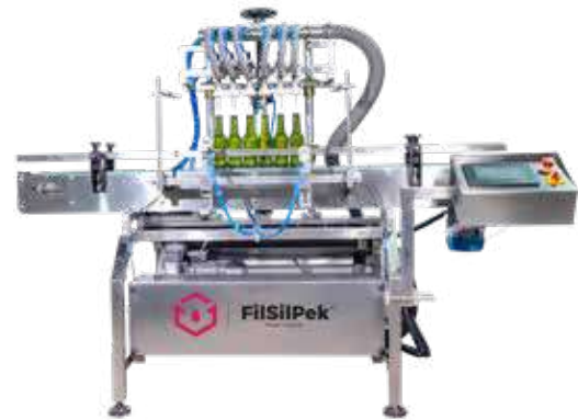
Automatic Air jet Cleaning Machine