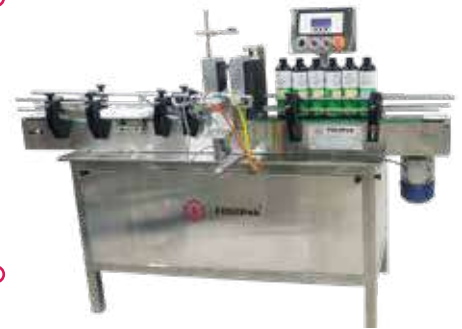
Automatic Pneumatic Round Bottle Sticker Labelling Machine

Label Length: 200 mm to 450 mm Label Height : 10 mm to 150 mm