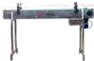
MS & SS Belt Conveyor